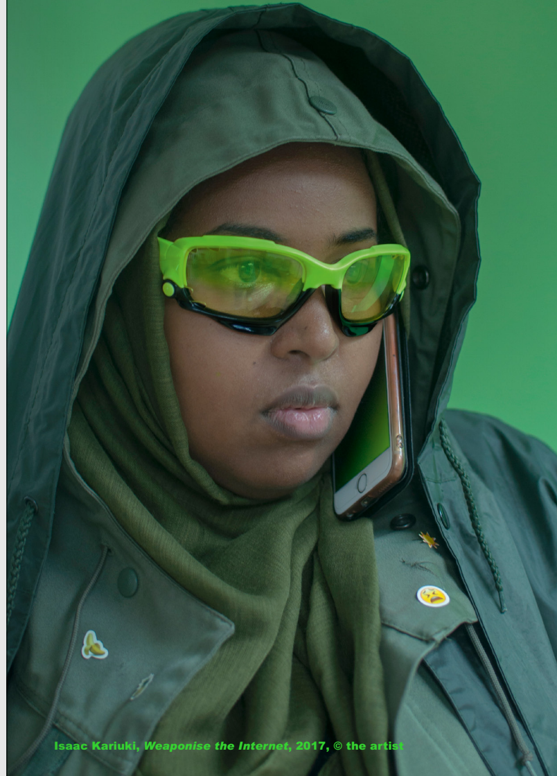
Isaac Kariuki, Weaponise the Internet , 2017, © the artist

Isaac Kariuki, born in 1993 in Nairobi (KE), lives and works in London (UK) and Nairobi (KE).