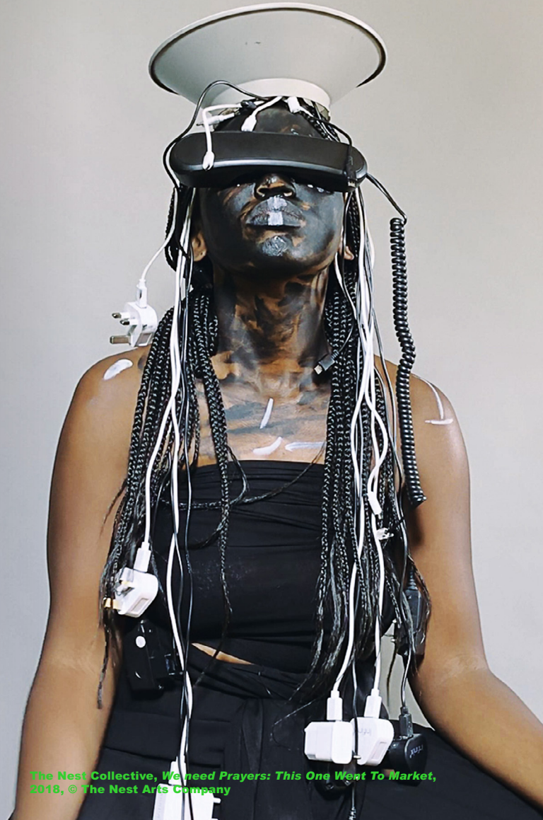
The Nest Collective, We need Prayers: This One Went To Market, 2018