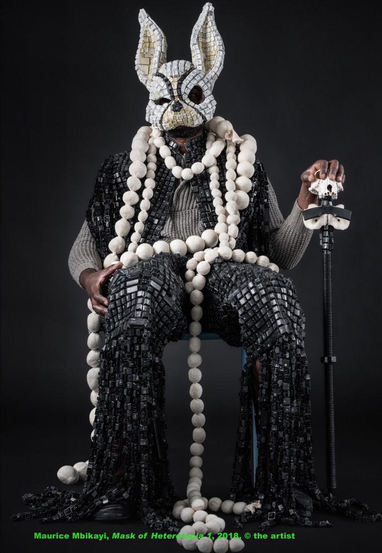
Maurice Mbikayi, Mask of Heterotopia 1 , 2018. © the artist

Maurice Mbikayi, born in 1974 in Kinshasa (CD), lives and works in Cape Town (ZA).