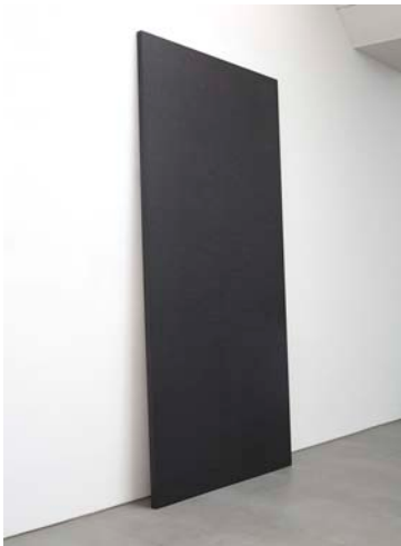
2016_ns_Maria-Taniguchi_I See, I Feels_006.jpg

Workshops and Performance