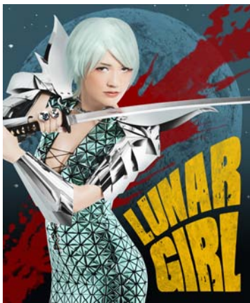
2016_ns_Sputniko!_THE MOONWALK MACHINE-SELENA'S STEP_003.jpg

Sputniko!, The Moonwalk Machine Selena's Step 2013