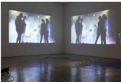
2016_ns_Nile-Koetting_Hard In Organics_007.jpg