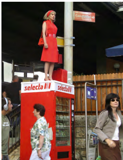
Chantal Michel, Die Frau in Rot , 2004, performance, Nyon, FAR – Festival des Arts vivants, © art work, photo: Chantal Michel

Swiss video, photo, and performance artist Chantal Michel is well-known for such provocative as well as poetic interventions in public space. Dressed in eye-catching apparel, lost in time, or slipping into various roles, she astonishes onlookers by appearing on church spires, monuments, or on other unusual sites. She infiltrates central building sites in Karlsruhe inner city as a foreign body, contrasting the activities of the construction workers by a moment of silence, but also provocation. Cyclists and pedestrians are invited to pause in front of the building site for a few minutes or hours in an attempt to discern Chantal Michel's form when surrounded by pipes, building blocks, heaps of sand, and diggers. Through this intervention the construction site evolves into a search game combining movement and standstill, art and everyday business in an absurd image.