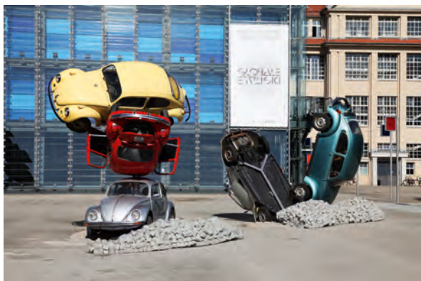
Hans Hollein, Car Building , 1960/2011, VW Beetles, steel, stones, © art work: Hans Hollein, photo: ZKM | Center for Art and Media Karlsruhe, Anatole Serexhe

Hans Hollein in one of his numerous publications. In the design of his two-part sculpture Car Building , for example, he thus replaces usual building materials by cars. Five differently colored VW Beetles stacked on top of one another on a polyaxial rotation, struggle to maintain balance. The work, first shown at the exhibition Car Culture. Media of Mobility at the ZKM | Karlsruhe in 2011, is scheduled for presentation in front of the “K.” as part of the The City is the Star . In view of the construction work on the central traffic axis, it appears as if, for functional reasons, the VW Beetles have been shoved off the street and onto the sidewalk next to the Information Pavilion – an appropriate image for traffic rerouting. This work is also provocative and unsettling – a sort of surreal commentary on everyday life.