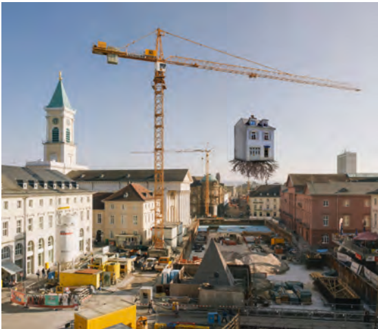
Leandro Erlich, Pulled by the Roots , 2015, outdoor installation with crane, mixed media, Karlsruhe, © art work, visualization: Leandro Erlich Studio

The key art work of The City is the Star presents the large-scale installation by Argentinian artist Leandro Erlich. A huge construction crane bearing an unusual payload is positioned directly on Marktplatz: an entire house hovers in midair on steel ropes! Inspired by one of architect Friedrich Weinbrenner's historical structures, the building, together with its massive root system, quite literally appears to be ripped out of a row of neighboring houses. With this work, Erlich – well-known throughout the world for his hyperreal sculptures and installations – explicitly addresses global themes, such as uprooting, migration, or simulation. By drawing on the crane in the context of construction measures in Karlsruhe inner city, he utilizes a key civil engineering tool, thereby adding a provocative element which, in the first instance, makes one think that the crane driver has made a mistake.