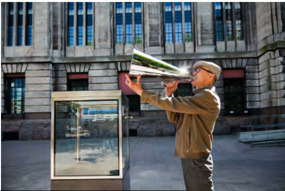
Elmgreen & Dragset, It's Never Too Late To Say Sorry, 2011/2012, installation, performance © art work: Michael Elmgreen & Ingar Dragset, courtesy Sculpture International Rotterdam

The performance by the Danish-Norwegian artist duo Michael Elmgreen and Ingar Dragset focuses on the act of apology. Over the entire duration of the exhibition, every day at around 12 p.m. a man approaches a glass-domed vitrine at Karl-Friedrich-Straße from which he takes a megaphone and proceeds to call out the title of the work to passersby: It's Never Too Late To Say Sorry . Though the performance was designed in 2011 for Sculpture International Rotterdam , and was on show in Munich and New York, it alters its meaning depending on the cultural, regional, and historical context of each performance venue. In Karlsruhe, the declaration makes reference to the city, which apologizes to the inhabitants for the construction projects in the inner-city area. At the same time, and with a certain wink of an eye, this provocative action calls for passersby to reflect on their attitudes, and to express such apologies, which possibly are still outstanding.