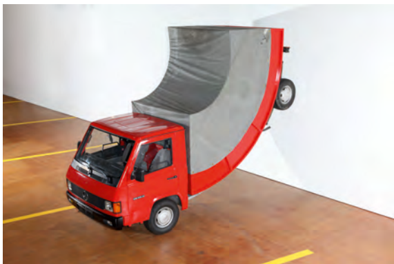
Erwin Wurm, Truck , 2011, installation with motor truck Mercedes-Benz MB, © art work: Erwin Wurm, photo: ZKM | Center for Art and Media Karlsruhe, Anatole Serexhe

With his inflated houses, twisted cars, and his participatory One Minute Sculptures , he ironically questions the visual appearance of status symbols and the significance of social conventions. For the city's anniversary, Wurm has a bright red truck reverse up a wall of the Weinbrennerhaus. Elegantly bent upwards at the center, the Truck appears to effortlessly overcome its own weight, and to adapt itself in conformity with the shape of the representative building. Owing to its physical distortion, this utility vehicle assumes a sculptural character, while its function now becomes of secondary importance to its artistic form. The façade of the house also loses its original meaning: becoming both parking space and street for the truck, the wall serves less as a shell for the interior but more as a stage for art.