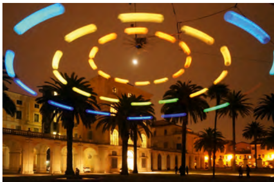
Tim Otto Roth, Heaven's Carousel , 2014, kinetic outdoor sound and light sculpture, Rome, © art work: imachination projects

With Heaven's Carousel , a luminous Sound UFO seems to land in front of the Natural History Museum, which newly interprets the ancient music of the spheres according to twenty-first century astrophysics. A carousel construction of 36 illuminated loudspeakers integrated into globe-shaped forms suspended to a crane by twelve strands hovers at an airy ten-meter height. In the evening, Heaven's Carousel takes off: set in rotation, the loudspeakers, integrated into the illuminated spheres, hover above the visitors' heads in a diameter of 16 meters. One is invited to move freely around under the installation to explore the continually changing universe of sound. Though "only" pure tones emanate from the single loudspeakers, they recombine in space into complex audio images. In the process, due to the Doppler effect, one tone sounds higher when the sound wave flies towards the visitor, and lower, when retracting.