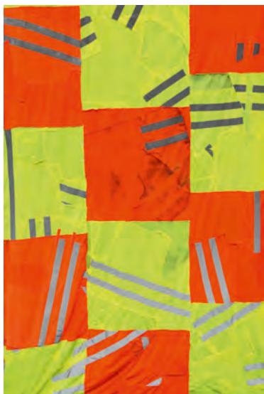
Wermke/Leinkauf, Landmarks (Detail) , 2013 (used safety jackets), © art work, photo: Wermke/Leinkauf

Artist duo Wermke/Leinkauf has acquired renown by its outlandish and subversive interventions in urban space. Wearing apparel of construction workers, they provoke onlookers by walking on bridge railings, cleaning the windshields of parking cars, or by showing themselves performing a handstand on a city hall tower. In Karlsruhe the artists question the safety measures connected with the construction of the underground and the new traffic regulations. Installations with flags made of the material used for warning and security vests as well as colorful murals serve as a visual bracket for the duo's performative interventions in the urban area. Installed behind platforms at the central station, the self-stitched flags thematize the role and function of barriers and prohibition signs used for the protection of the city inhabitants. An absurd seeming construction fence in an unusual place encourages passersby to newly discover familiar objects, to question the significance of conventions, and to sound out the boundary between art and everyday life.